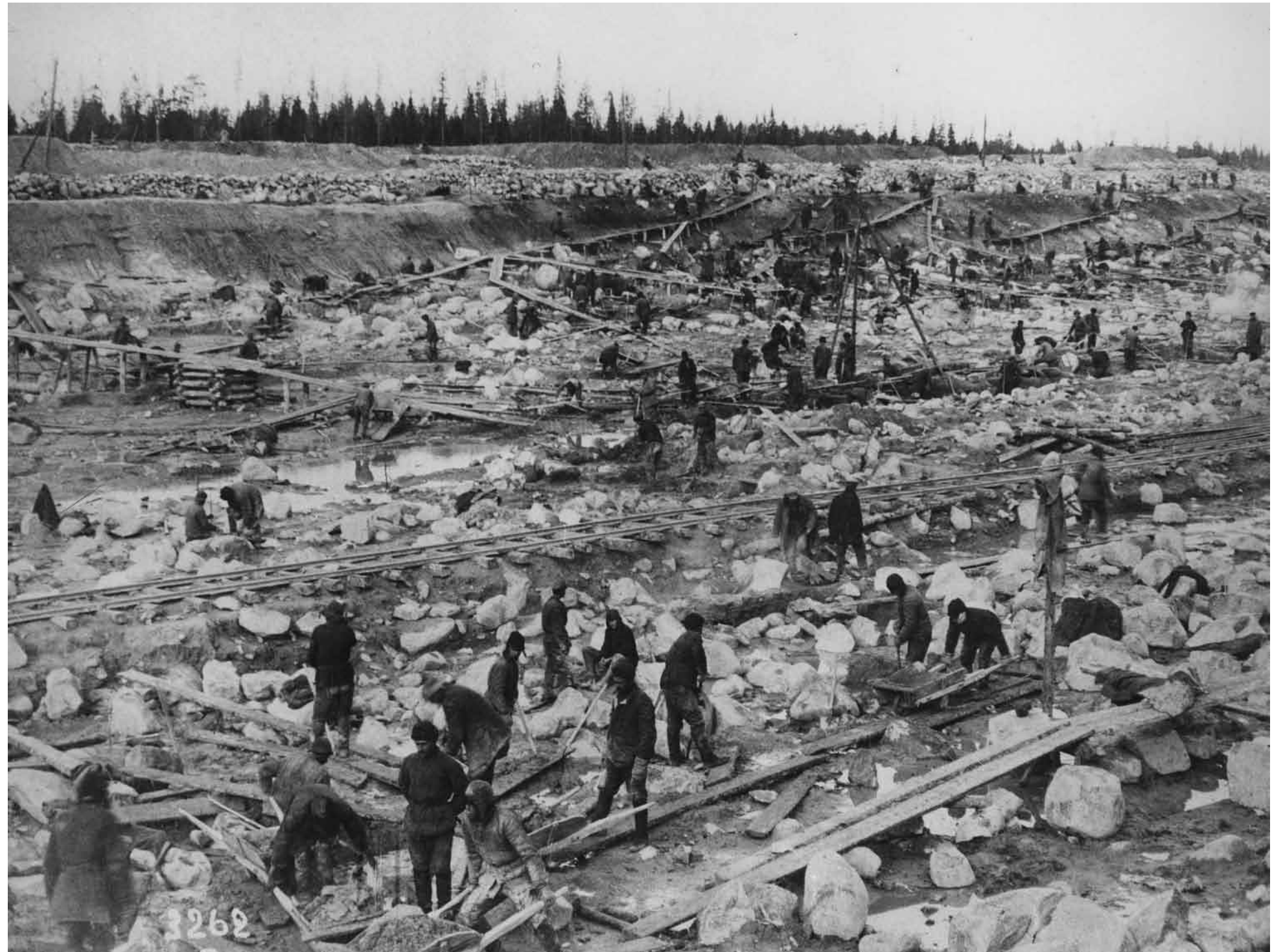
Construction of the White Sea Canal, 1932.

At the beginning of the 1940s the number of death sentences declined noticeably, but parallel to this the flow of prisoners sent to the Gulag swelled and stabilised. In 1940 the 53 gigantic groups of camps, with their millions of annexes and subsections, their 425 colonies, 50 children’s colonies and 90 “infant homes”, contained 2.35 million persons.