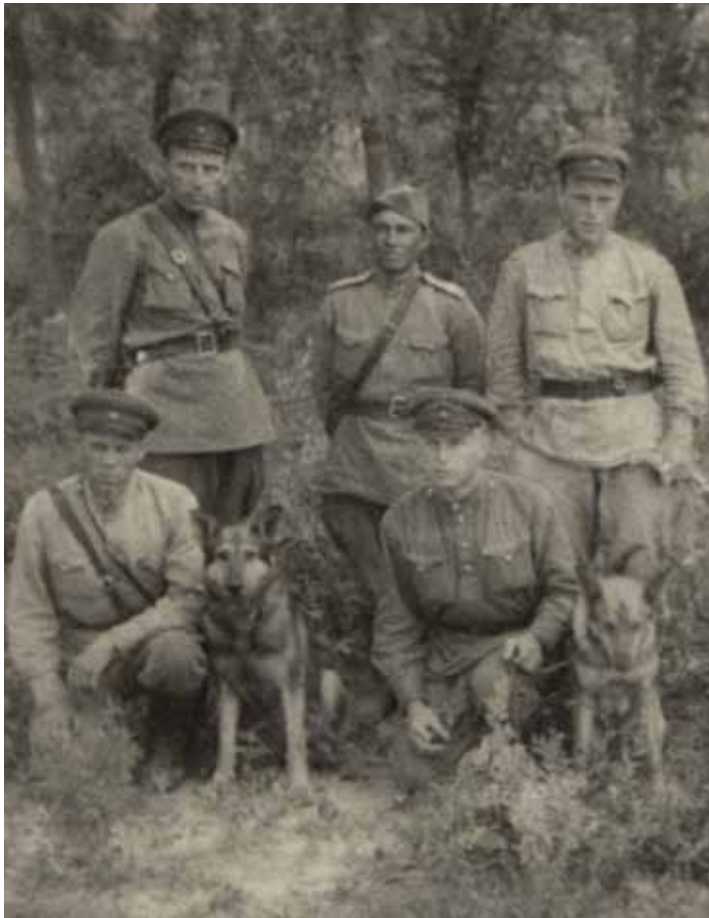
Guards with dogs, Tagli, the 1940s

A gradual reform of the camps system began after the death of Stalin, March 1954. But the Soviet Union's new leaders took their time, provoking a wave of strikes and uprisings in the camps. The risings in Vorkuta, Norilsk, Kazakhstan and Kolyma did speed up the reorganization of the system. The year 1954 saw the beginning of mass releases, followed by the rehabilitation of political prisoners.