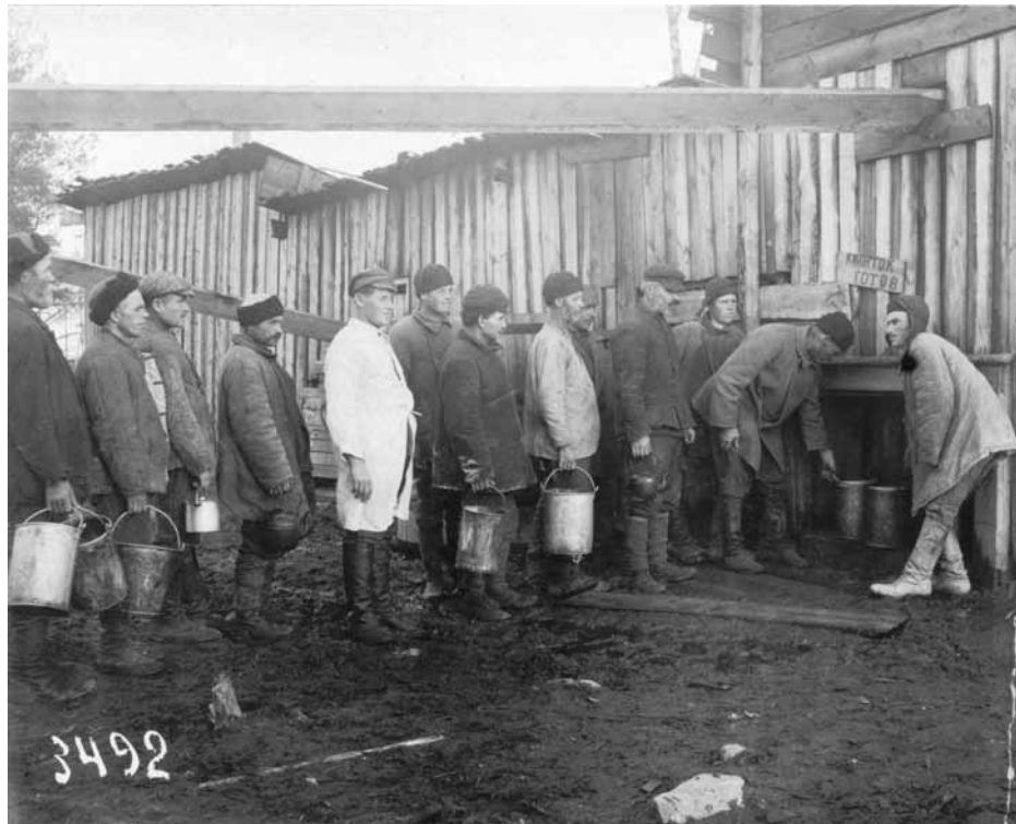
Distribution of hot water.

ed diseases such as pellagra, scurvy and night blindness. Camp medicine was indifferent to the individual human being. Whatever the complaint brought to them, the male nurses, medical assistants and doctors, not daring to exceed the quota of patients allowed under the plan, would confine themselves to taking a half-dead man's pulse before pronouncing him to be "in good health" and sending him back to work.