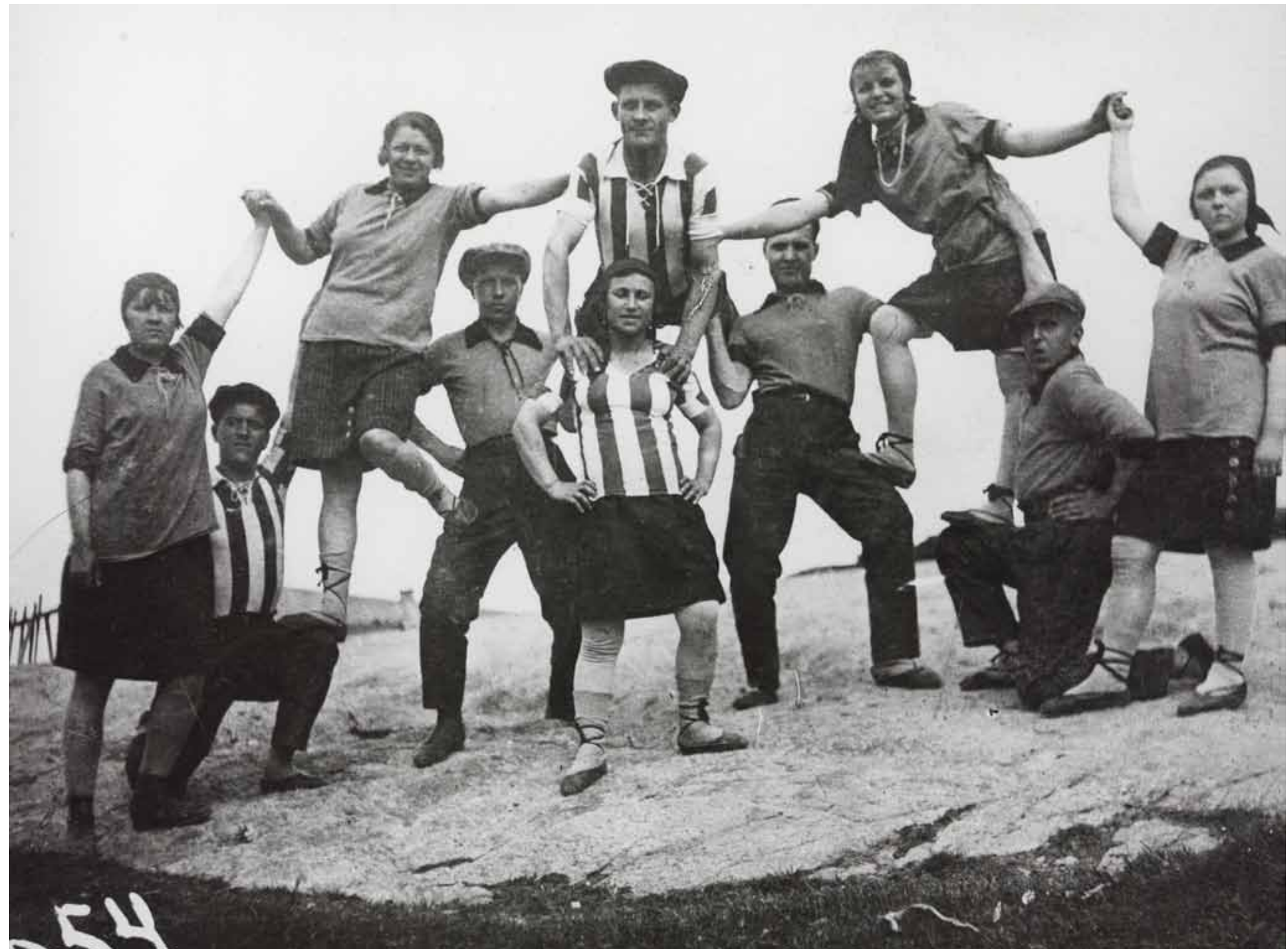
Performance by the propaganda brigade, White Sea Canal, 1932.

After the Great Terror of 1937-1938 the work of culture and education sections dwindled rapidly. From an instrument of “re-education”, the camp was reduced solely to a means of exploiting the labour of “enemies of socialism”.