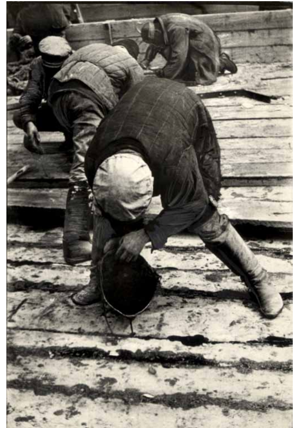
Construction of White Sea channel, 1932, photographed by Aleksandr Rodsjenko.