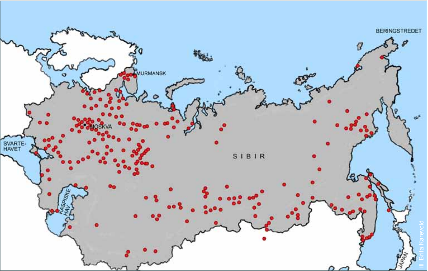
“LABOUR- AND RE-EDUCATION CAMPS” IN THE SOVIET UNION 1923–1961.

The points show the largest administrative units in the Gulag camp system. Not all were in operation simultaneously. For each improvement camp there was many departments, all in all more than 3,000 in the Gulag.