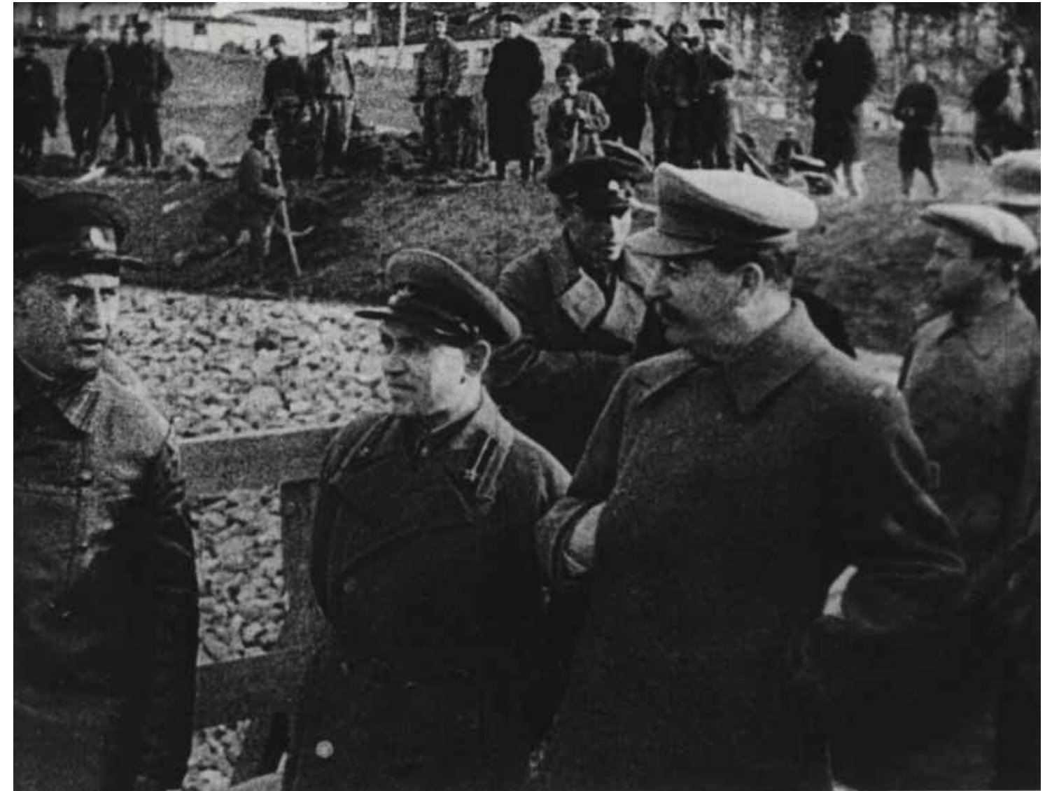
Josef Stalin and the NKVD chief Jezjov inspect the construction of the White Sea Canal, 1934.

Camp life was regulated by orders and signals. A prisoner who broke a rule or failed to obey an order laid himself open to various forms of punishment. He might be beaten, drenched with water and made to stand outside in the icy cold, locked up or sent to the punishment cells.