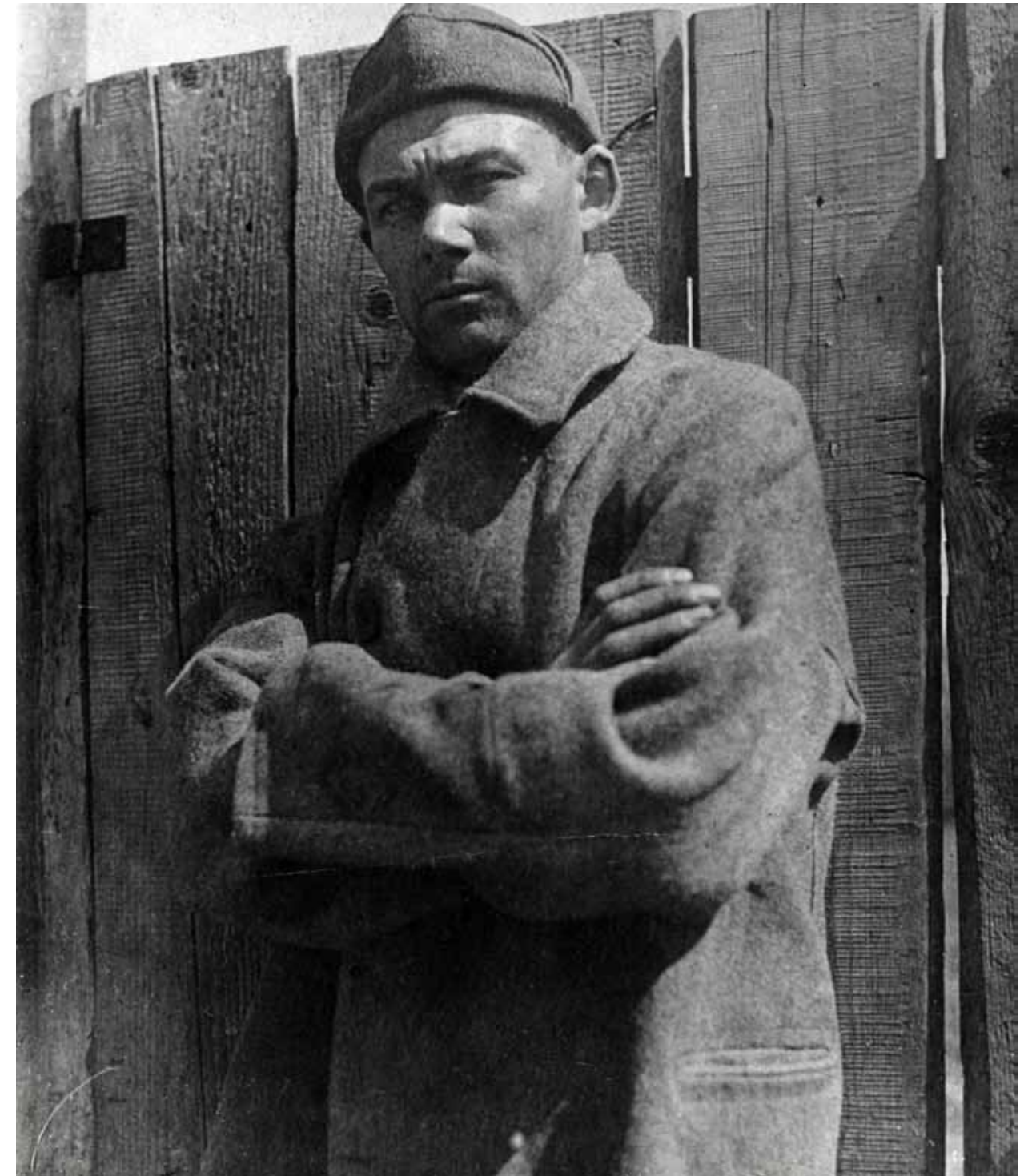
A zek, the 1930s.