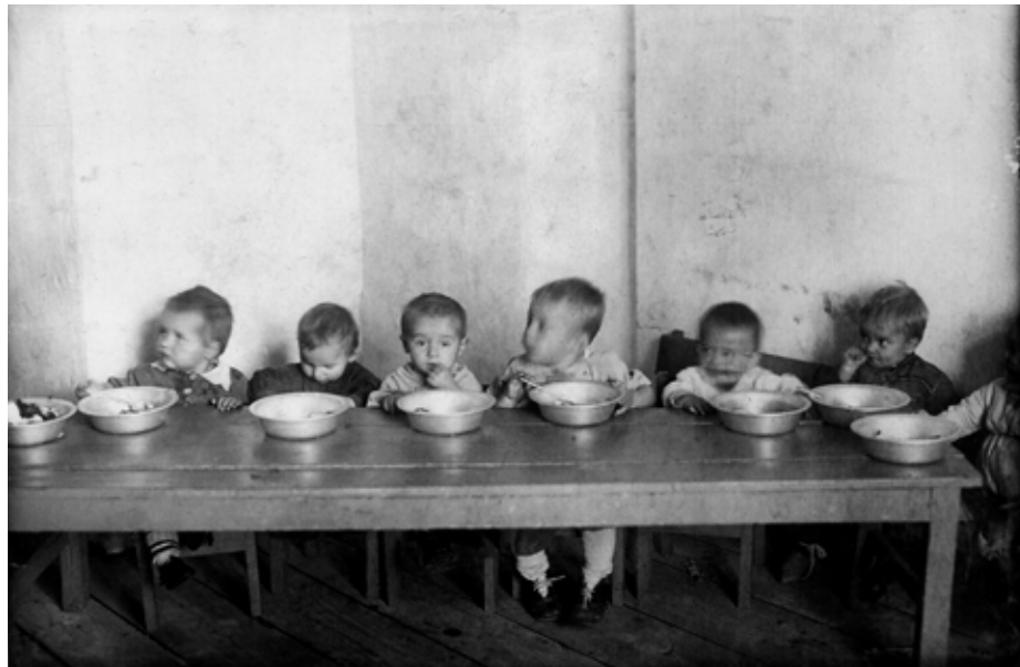
Left: The Infant's house in the Jagri Camp, Arkhangelsk, the 1940s. Opposite page: Female labor brigade, railroad Baikal-Amur, 1933.

Until the mid-1930s, infants were kept in the camp in which their mother was confined until the age of 4. Later the age was reduced to 12 months. Children separated from their mothers were sent to special boarding schools or orphanages, where their mother's address was kept secret. Parents had practically no hope of finding their child again at some time in the future. The institutions in which these children were confined were, of course, different from the camps, but their organization and way of life were characteristic of the same repressive system.