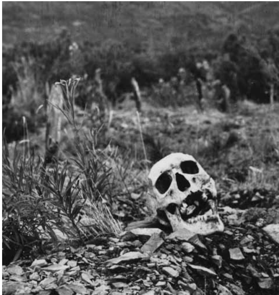
A prisoner's grave, Kolyma, the 1990s.

During recent years the Stalin period were used to rehabilitate and to restore Russia's greatness. In 2005 said 50% of Russians that Stalin had been a good leader, and 12% that he had had a very bad influence on the nation. He was in December 2008 voted by viewers in the state channel Rossia as the third greatest Russian in the country's history.