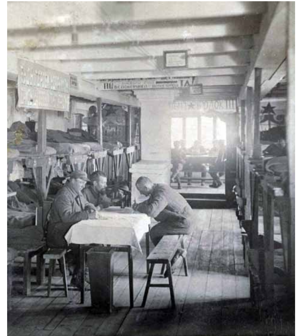
Interior, stay barracks (unknown camp).

interpenetrated each other and gradually came to form a single whole, the more so as recently released prisoners who had reason to expect being re-arrested preferred to settle nearby.