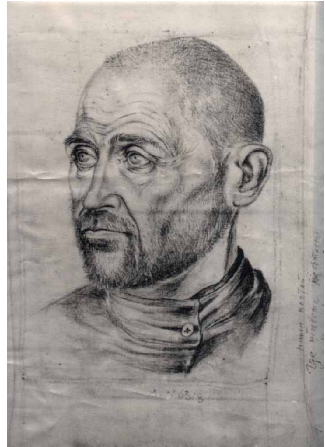
Portrait of a zek (unknown artist), the 1940s.

This gave rise to what could be called a "pocket-sized" culture. Small objects could more easily be hidden from view, disguised, kept as one's own property. Women prisoners, deprived of the strict necessities of life, learned to make sewing needles out of fish bones or broken-off bits of comb, which they concealed in their shoe-soles. The art objects created in the camps were tiny, designed for prolonged contemplation in the light of a 25-Watt lamp by men and women reduced to near-blindness by vitamin deficiency.